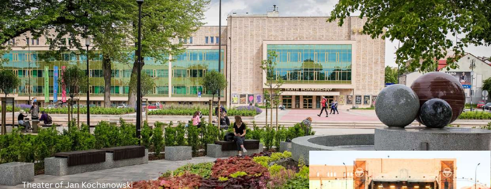
Theater of Jan Kochanowski

Operating since 1976, the theater is the only professional theater in Radom, and currently the facility is visited by about 70,000 spectators each year. The content presented here is diverse and appeals to many audience groups.